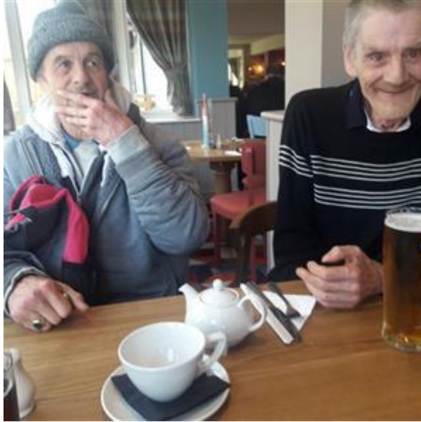
Lads lunch out.

We continue to go out as much as possible, and always looking for new places to visit.