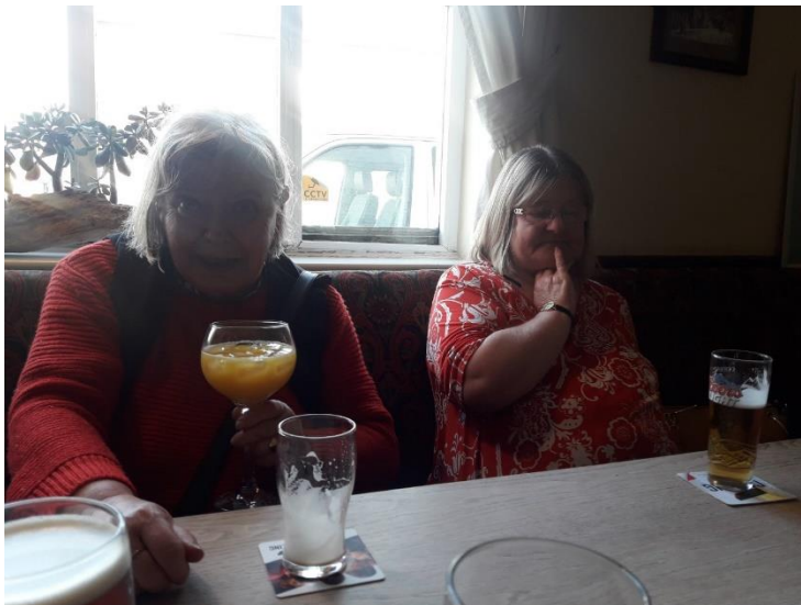
The Girls like a drink too!!