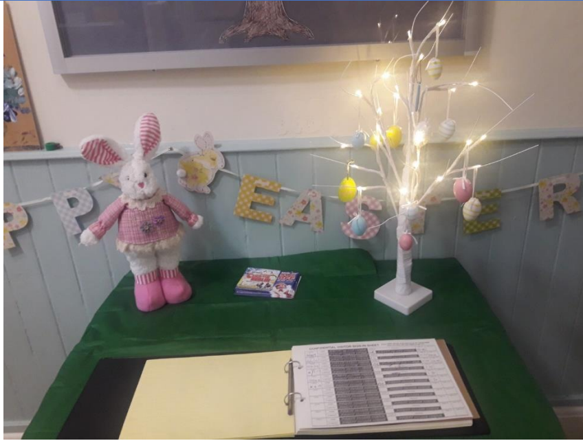
DECORATED OUR RECEPTION AREA

The residents were enjoying Hot Cross Buns on Good Friday.